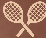
Squash & Tennis Court